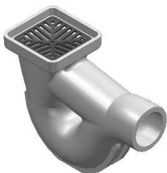
ISOMETRIC VIEW 1:10