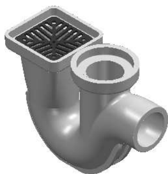
ISOMETRIC VIEW 1:10