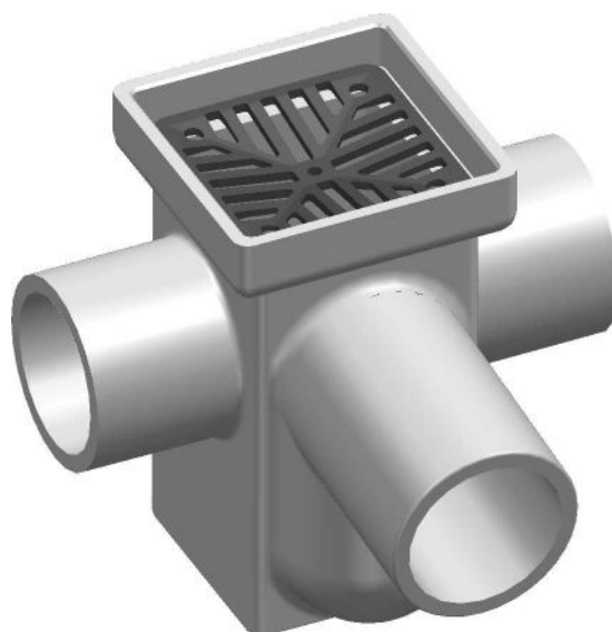
ISOMETRIC VIEW 1:5

COMPLETE WITH CAST IRON SQUARE GRATE 150 x 150 (6" x 6") CODE KIG2C