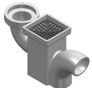
ISOMETRIC VIEW 1:10