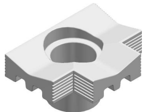
ISOMETRIC VIEW 1:5