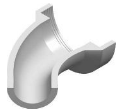
ISOMETRIC VIEW 1:10